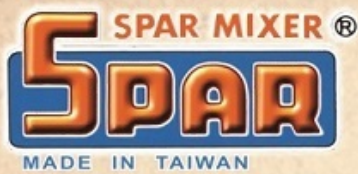
Table-Top Mini Mixer

Satisfying The Demanding Professional Needs Mixes All Ingredients Thoroughly